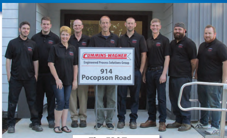
The EPS Team.