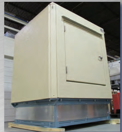
Weather proof fiberglass enclosure.

In addition to pan mounted pump packages, we offer a weather proof, free standing stainless steel cabinet option and a weather proof, fiberglass enclosure with lighting and heat option. Both options include control panels as well.