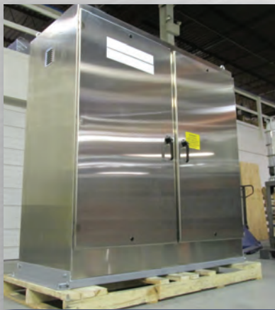
Weather proof, free standing SS cabinet.

In addition to pan mounted pump packages, we offer a weather proof, free standing stainless steel cabinet option and a weather proof, fiberglass enclosure with lighting and heat option. Both options include control panels as well.