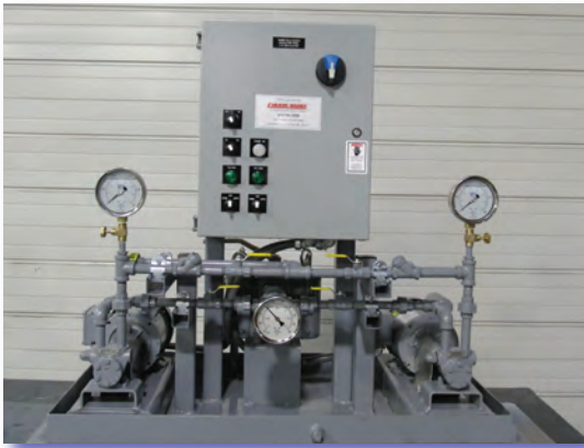
Note: simplex and triplex configurations also available.