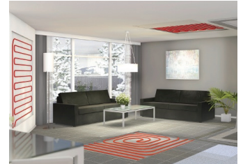
Rehau Radiant Floor Heating, Cooling, Snow and Ice Melt Systems