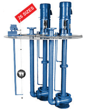
Vertical Process, Sewage and Sump Pumps