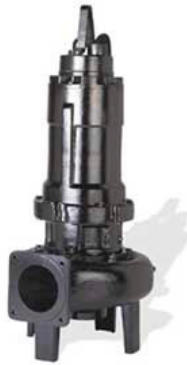
Submersible Sewage and Sump Pumps