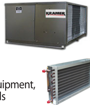
Kramer Refrigeration Equipment, Replacement Coils