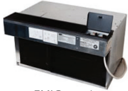
EMI Retroaire Replacement PTAC/VTAC Systems