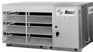
Russell Refrigeration Equipment