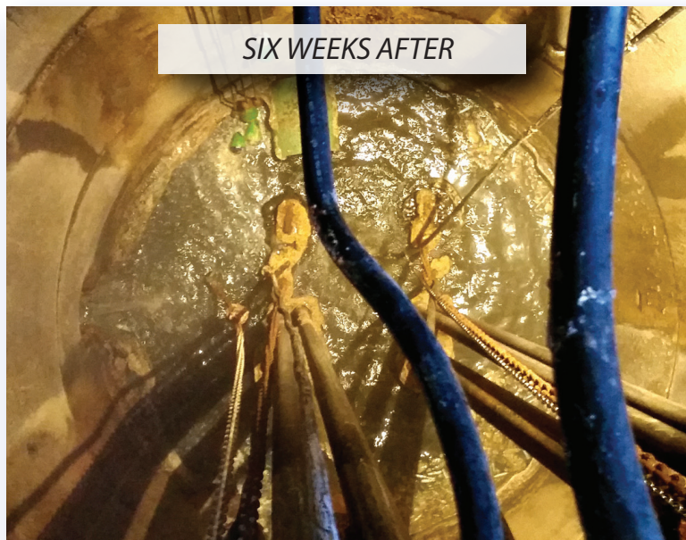
SIX WEEKS AFTER