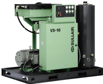
VS Series Rotary Screw Vacuum Systems