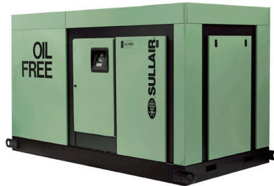
Oil Free Rotary Air Compressors