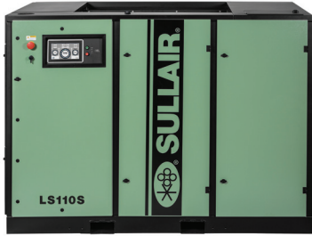
LS Series Lubricated Rotary Screw Air Compressors